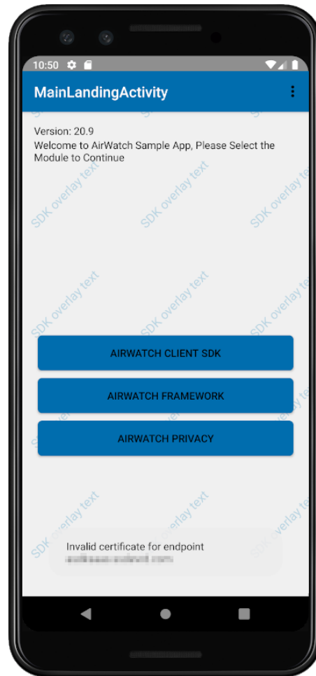
Screen capture 2: Watermarked User Interface

The following screen capture shows a sample application with a Workspace ONE watermark overlaid on the user interface.